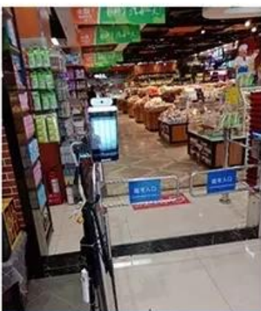
Supermarket / Plaza